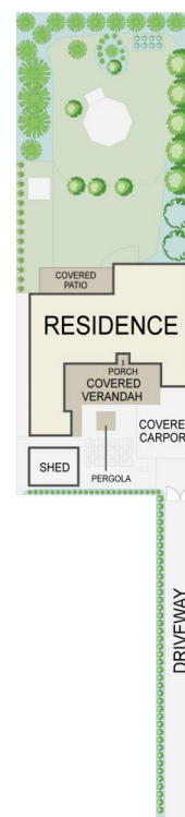
SITE PLAN APPROX. INT: 216m 2 APPROX. LAND: 1195m 2